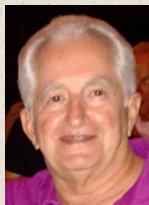
Member at Large 1 Crosstalk Editor