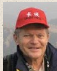
Member at Large 2